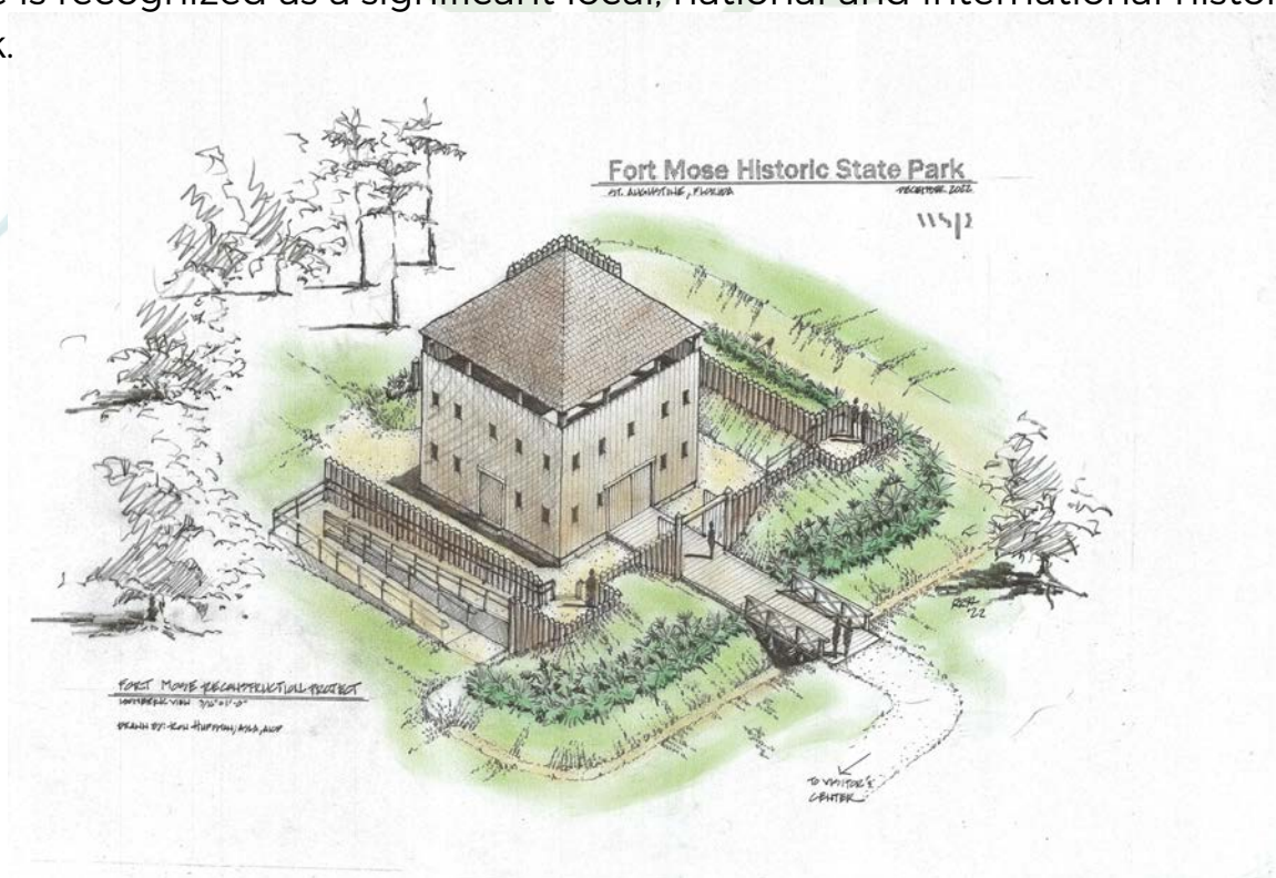
Conceptual rendering of the 1738 fort.

Over the years, the Fort Mose site was swallowed by marsh, and the important legacy of its community was largely forgotten. Late in the twentieth century, a highly dedicated team of archaeologists, historians, government leaders and committed citizens helped restore Fort Mose to its rightful place of honor. Today, Fort Mose is recognized as a significant local, national and international historic landmark.