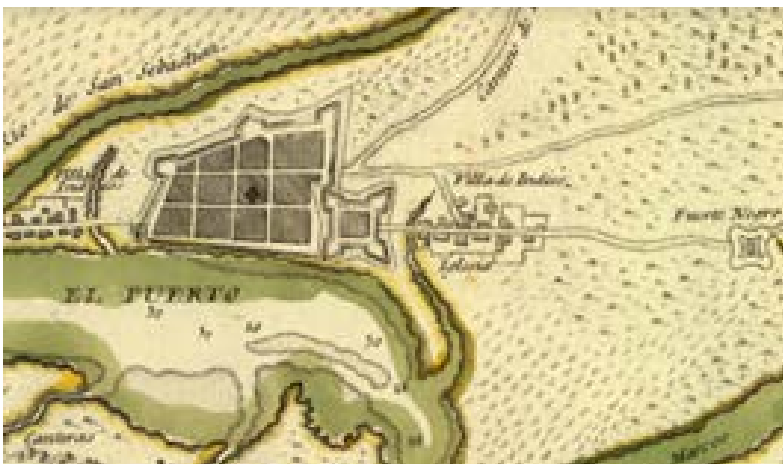
Fort Mose historical map