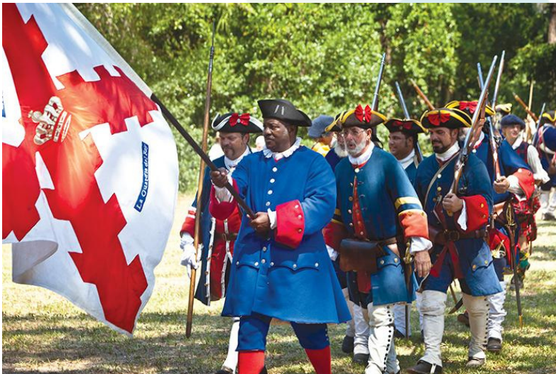
Fort Mose Historical Society re-enactors